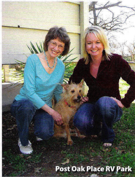
Post Oak Place RV Park

“We’re not quite sure how old Myska is or