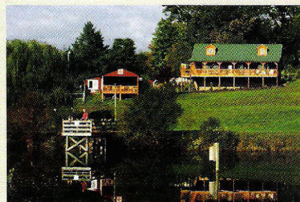
The Catch: Barkwells' stocked catfish pond offers a chance for you and your buddy to fish together.

Ponder Cove offers a memorable bed-and-breakfast experience where you can luxuriate in a bucolic setting only 30 minutes north of Asheville in Mars Hill. Your furry friend will love the welcome basket and complimentary treats, as well as romping on 91 acres of protected paradise with canine staff members Ponder, Buck, and Dolly Mae. You'll enjoy the spacious country-style rooms and gourmet breakfasts prepared by owner and innkeeper Martha Abraham. For more privacy, stay in the fully restored 1938 cottage.